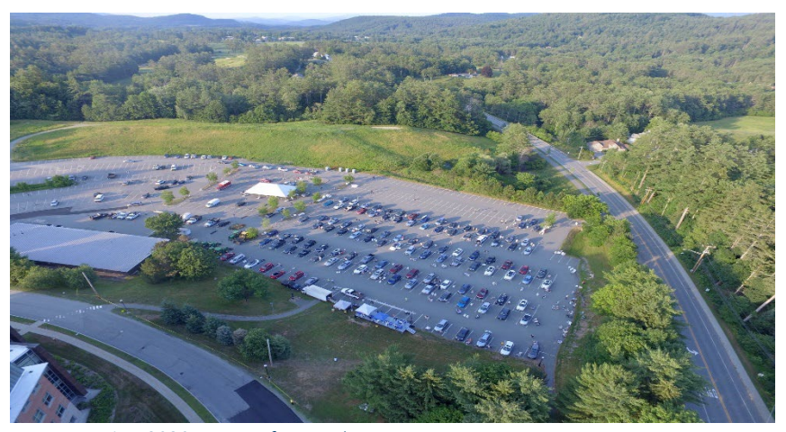
Town Meeting 2020 as seen from a drone

The town invites the entire Hanover community to immerse themselves in the contents of this Plan, beginning with the Vision Statement and Goals (presented in this chapter), as well as its Strategies and plan for implementation in Chapter 11 , to understand where the town is headed. The community's ongoing support for this Plan is pivotal to getting the town to where it wants to be over the next decade.