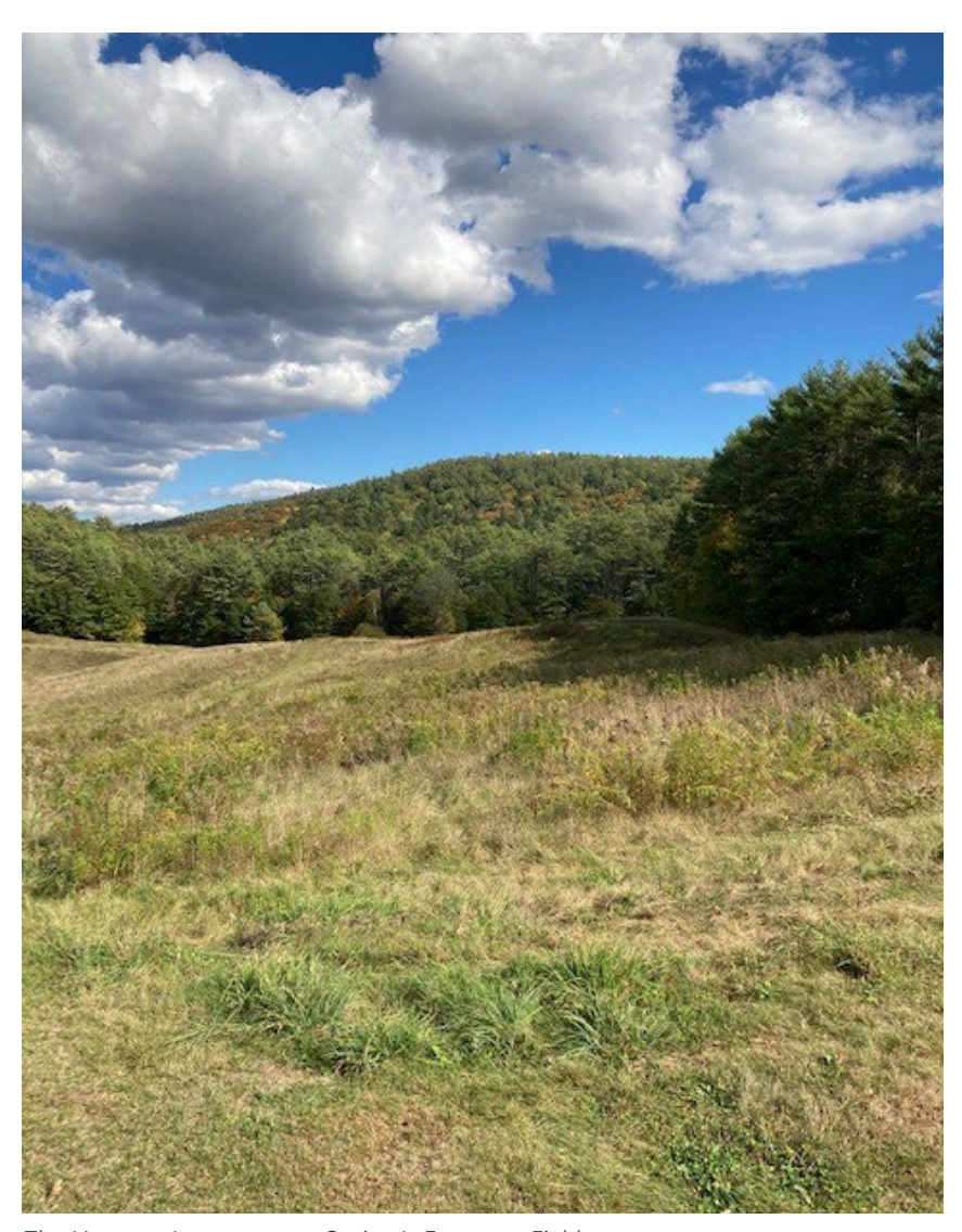
The Hanover Improvement Society's Ferguson Field